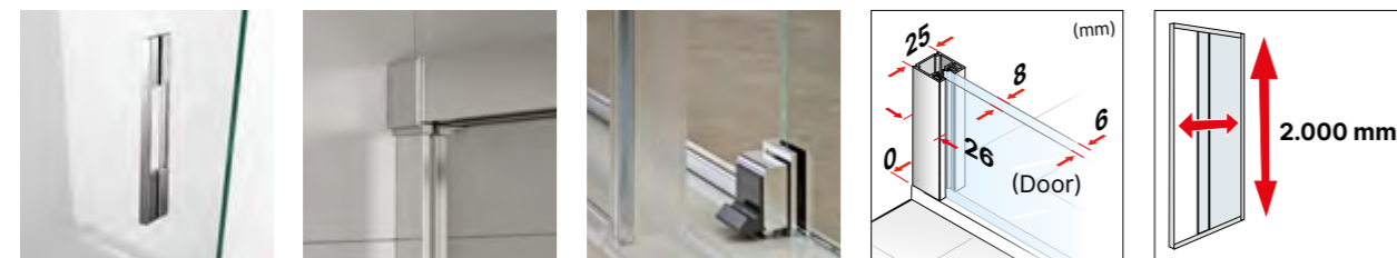
HANDLE TR Push&Clean For other lines and installation options, please consult Special height: from 1.801 to 2.400 mm. Access: website / configurator.