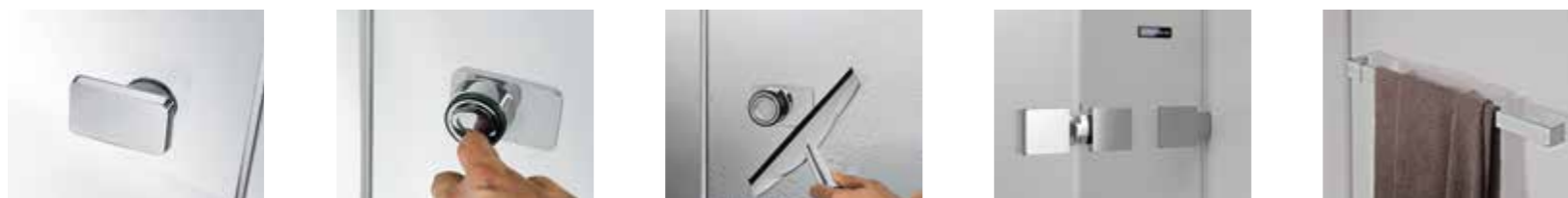
Interior cleaning without obstacles.