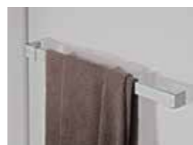
OPTIONAL: TOWELBAR / SHELF-CRYSTAL see pages 275