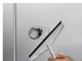
Interior cleaning without obstacles.